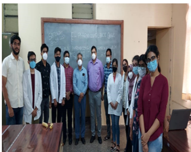
Online Pharmacovigilance Quiz & Group Photograph with participants