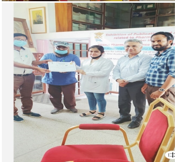
(Winners taking certificate of poster presentation on Pv)

The celebration of National Pv Week came to an end after valedictory function at IPC.