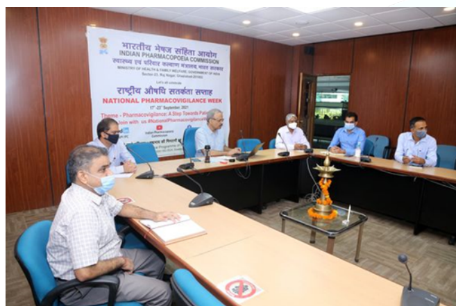
Inauguration Ceremony of National Pharmacovigilance Week celebration pan India