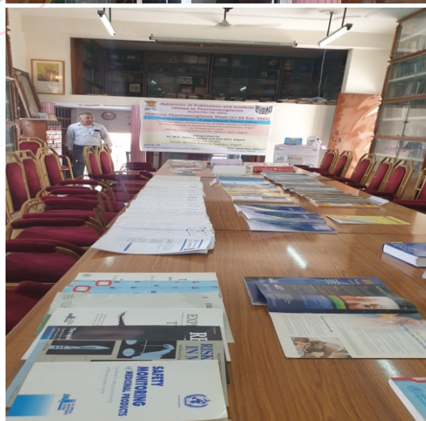
(Inauguration of the Exhibition by chief guest and display of publications on Pv)