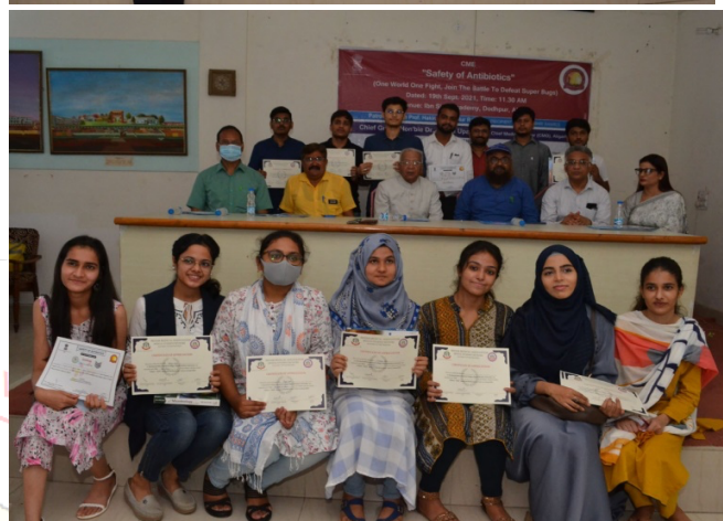
(Students receiving participation certificate and posing with dignitaries)