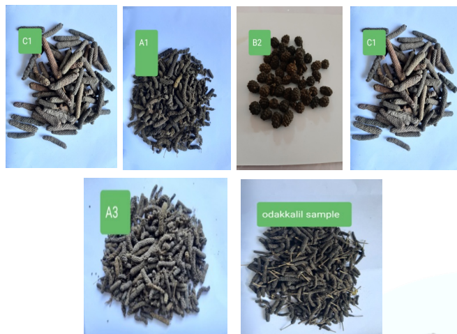
Table 1: Qualitative analysis

Marked variation are noted in the macroscopic characters like size, shape and odour. Some samples showed marked difference in the size when compared with normal size i.e 2.5-5cm long. Some samples are round in shape compared to normal long spike.